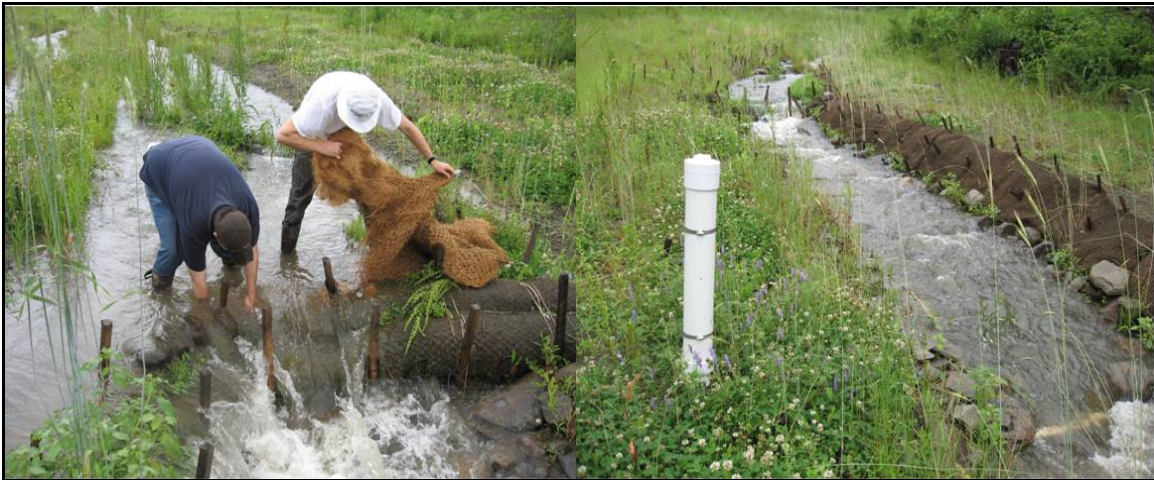
Figure 1: Herrick Hollow Creek Restoration (New York) (Left) Interim In-stream Measures; (Right) Stream Bank, Floodplain and Riparian Zone Restoration by Reestablishing Native Vegetation

The interdisciplinary design and restoration master planning approach brought a level of stakeholder communication and engineering rigor to the project which served to maintain constructive interaction even in the face of severe weather and construction delays. Integrating the hydrology, fluvial geomorphology and floodplain ecological aspects received stakeholder support, and the consensus process allowed clear communication when change was needed. Supervision during various phases of construction, follow-up monitoring of the performance of the restoration and all work was conducted under the close scrutiny of multiple agencies was essential to ensure project success.